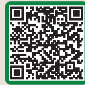
MANAGING STORED GRAIN