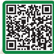
BIN OPERATION MANUAL