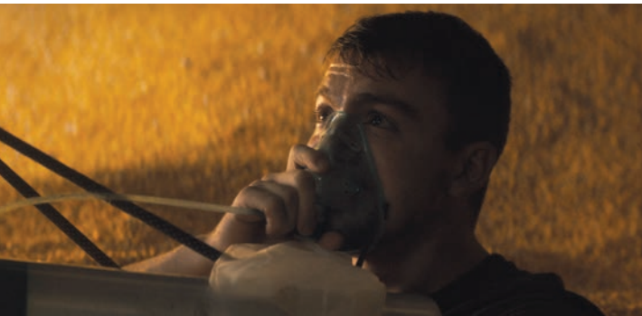
Depiction of a grain bin entrapment rescue from the movie Silo, a feature film inspired by true events.

After 8 seconds , you are completely covered